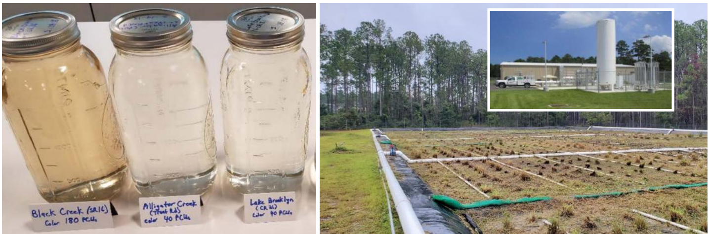
Illustrations from a presentation updating the Black Creek Project given at the 12/8/2020 SJRWMD Governing Board Meeting

BLACK CREEK UPDATE: To meet permitting requirements, the water brought from Black Creek must equal the clarity of the existing water in Alligator Creek before it is allowed into the creek. The water in Alligator Creek, which flows into Lake Brooklyn, seeps through the sandy bottom of the lake into the Upper Floridan Aquifer. The water samples in the photo above were collected 3/14/2018. The water from Black Creek at SR-16 measured 180 PCU (Platinum-Cobalt Units - a measure of color in the water on a scale from 0 to 500. Zero represents distilled water). Both the water from Alligator Creek at Treat Road and the water from Lake Brooklyn at SR-21 measured 40 PCU.