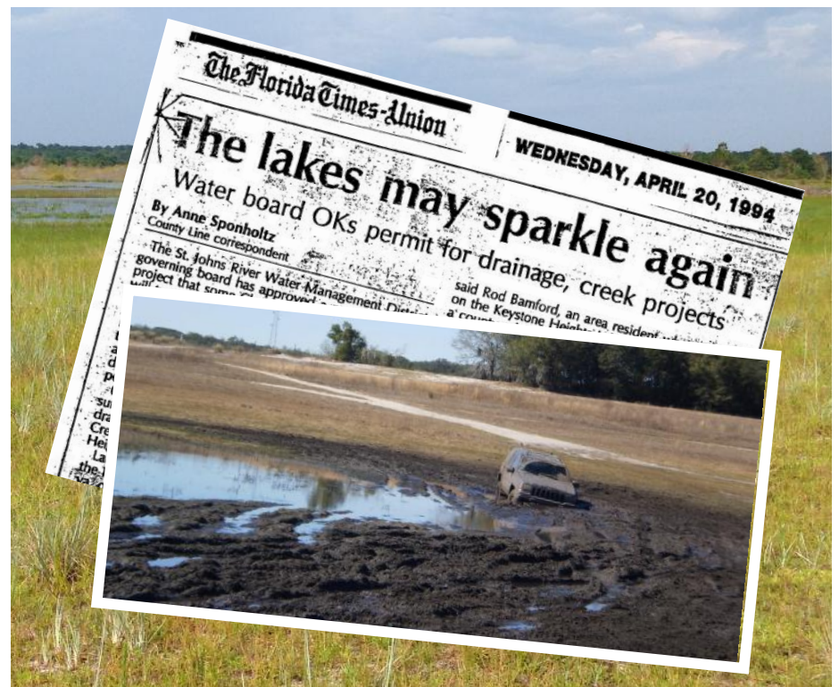
The mud bogger pic over a copy of a 1994 Florida Times-Union article reminds us that, until now, efforts towards saving our lakes have brought us more hope than water.

The desire to do the right thing by the lakes and the Keystone Heights Community was also expressed by the Utility Group at this meeting and at meetings of both the JEA Board of Directors and the Clay County Board of Commissioners that we were able to attend on