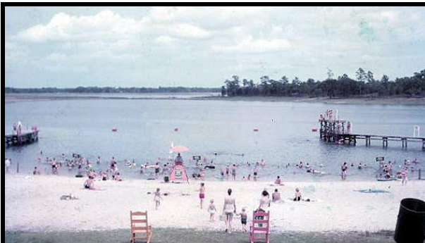
Gold Head Branch State Park in the 1950's

Webpage Design By: REALTY PRODUCTIONS CO. RealtyProductions.com – (904) 502-0165 - Email: wwwweb@realtyproductions.com