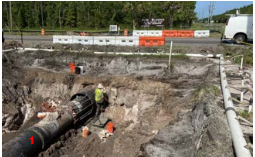
THE SR 21 PIPELINE: Above, the pipe installation has reached Gold Head Branch State Park! On the right, the pipe has been run in the casing under SR-21.

Brooklyn Level: 108.2 Ft Alligator Creek Flow: 6.3 MGD; Level: 110.2 Ft Geneva Level: 93.5 Ft S. Fork Black Creek (SR-16): Flow: 336 MGD (7/26) Note: July Monthly Avg Flow: 48 MGD; Level: 16.2 Ft Monthly Rainfall: 9.6" (Source: SJRWMD and USGS)