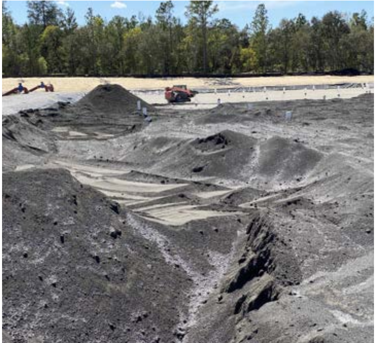
TREATMENT AREA Top: Cell 1 Plantings in media Abv. & lower left: Cell 2 media placement (cell 1 is on right) Middle left: Placement of liner in cell 6. Liner is tucked into a trench at the top of the cell.